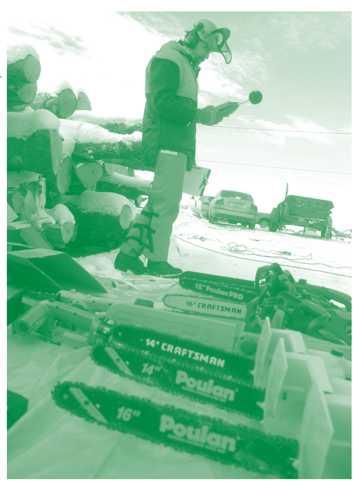
In the foreground, chainsaws are lined up in terms of subjective cut. In the background, NPC's Executive Director models chainsaw safety equipment including Husqvarna hardhat and hearing protection, Elvex vest, Husqvarna gloves, Husqvarna chaps, and Cove boots.