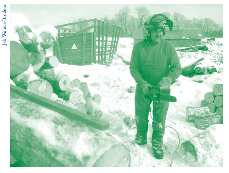
NPC chain saw test on a farm near Hardwick, Vermont.

Finally, with 18" and shorter bars, electric chainsaws are not going to be used to cut large trees. Since most chainsaw related fatalities occur while cutting down trees, cutting down medium to large trees is best left to professionals anyway. In the case where a quieter electric chainsaw is used to fell a tree, a spotter's warning would more likely be heard by the operator over the noise of an electric chainsaw than a gas powered one, making the operation slightly safer.