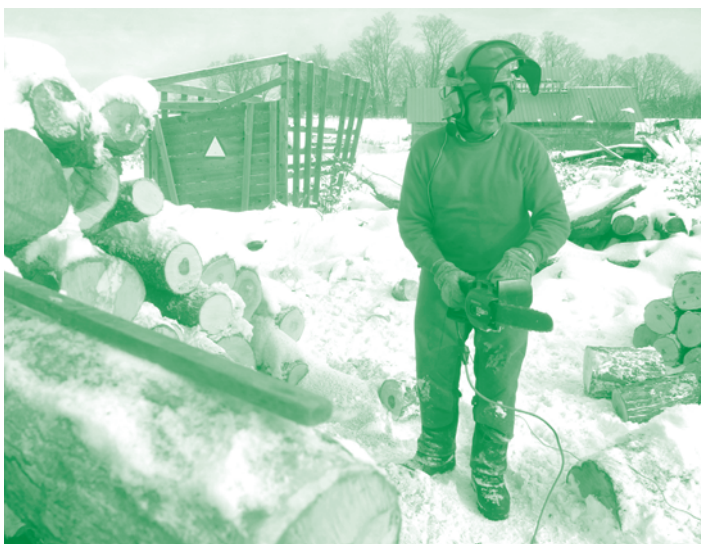
NPC chain saw test on a farm near Hardwick, Vermont.

Finally, with 18" and shorter bars, electric chainsaws are not going to be used to cut large trees. Since most chainsaw related fatalities occur while cutting down trees, cutting down medium to large trees is best left to professionals anyway. In the case where a quieter electric chainsaw is used to fell a tree, a spotter's warning would more likely be heard by the operator over the noise of an electric chainsaw than a gas powered one, making the operation slightly safer.