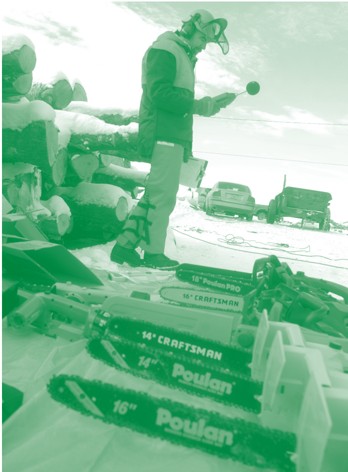
In the foreground, chainsaws are lined up in terms of subjective cut. In the background, NPC's Executive Director models chainsaw safety equipment including Husqvarna hardhat and hearing protection, Elvex vest, Husqvarna gloves, Husqvarna chaps, and Cove boots.